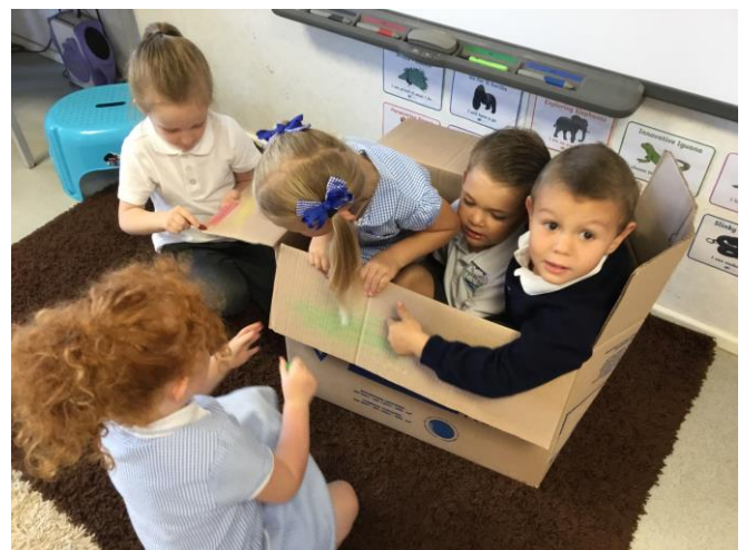
Acorn class’ box of fun