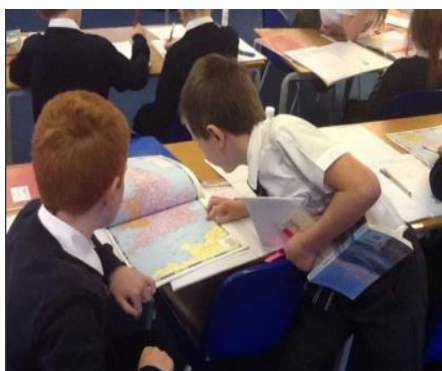
Willow Class - investigating the origin of place names

Please make sure you bring a warm coat & suitable outdoor winter clothing everyday