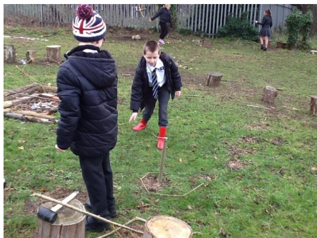
Oak class playing Hoopla like the Victorians they're learning about